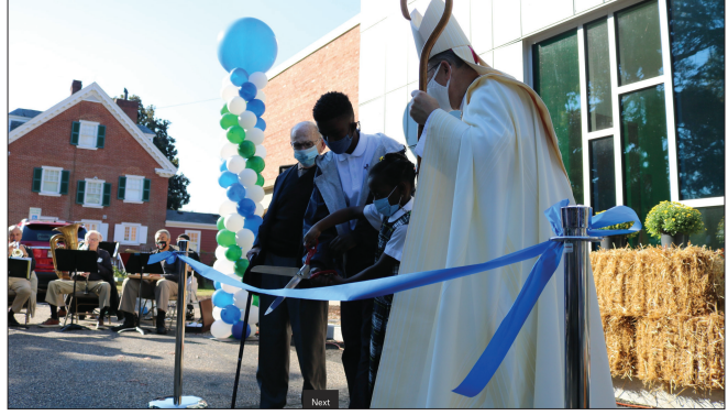
Dedication and ribbon-cutting - November 1, 2021

All Saints will be able to better provide a more competitive level of high school credit classes. The ability to do this is critical for our students to be accepted into the best Richmond area specialty and private schools where they can obtain the best college preparation. We want to equip our students to do and be their very best and continue the All Saints tradition of 100% graduation rate from high school with the high majority of students going on to college.